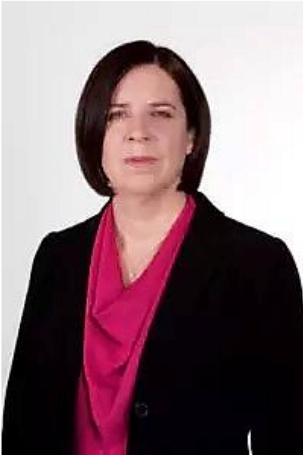
Criminal: malevolent 1 Director of Public Prosecutions in Republic of Ireland